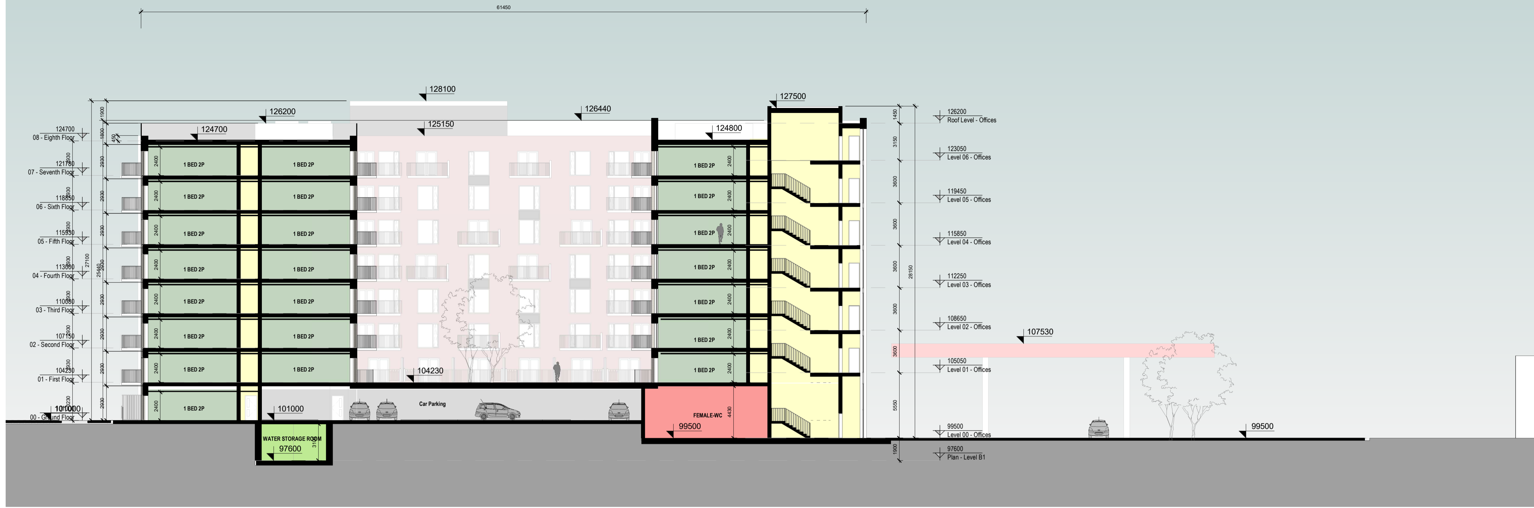
D3 Block D - Section D3